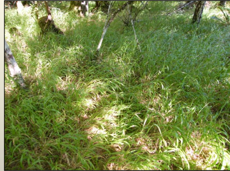
False brome near Corvallis

5:00-5:10. Top forest health issues in Oregon, as noted today, and good bye.