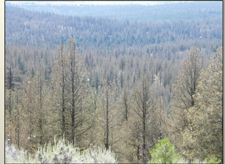
Pine butterfly defoliation, near John Day