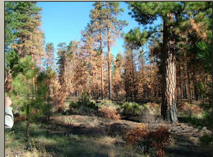
Fire effects near Sisters