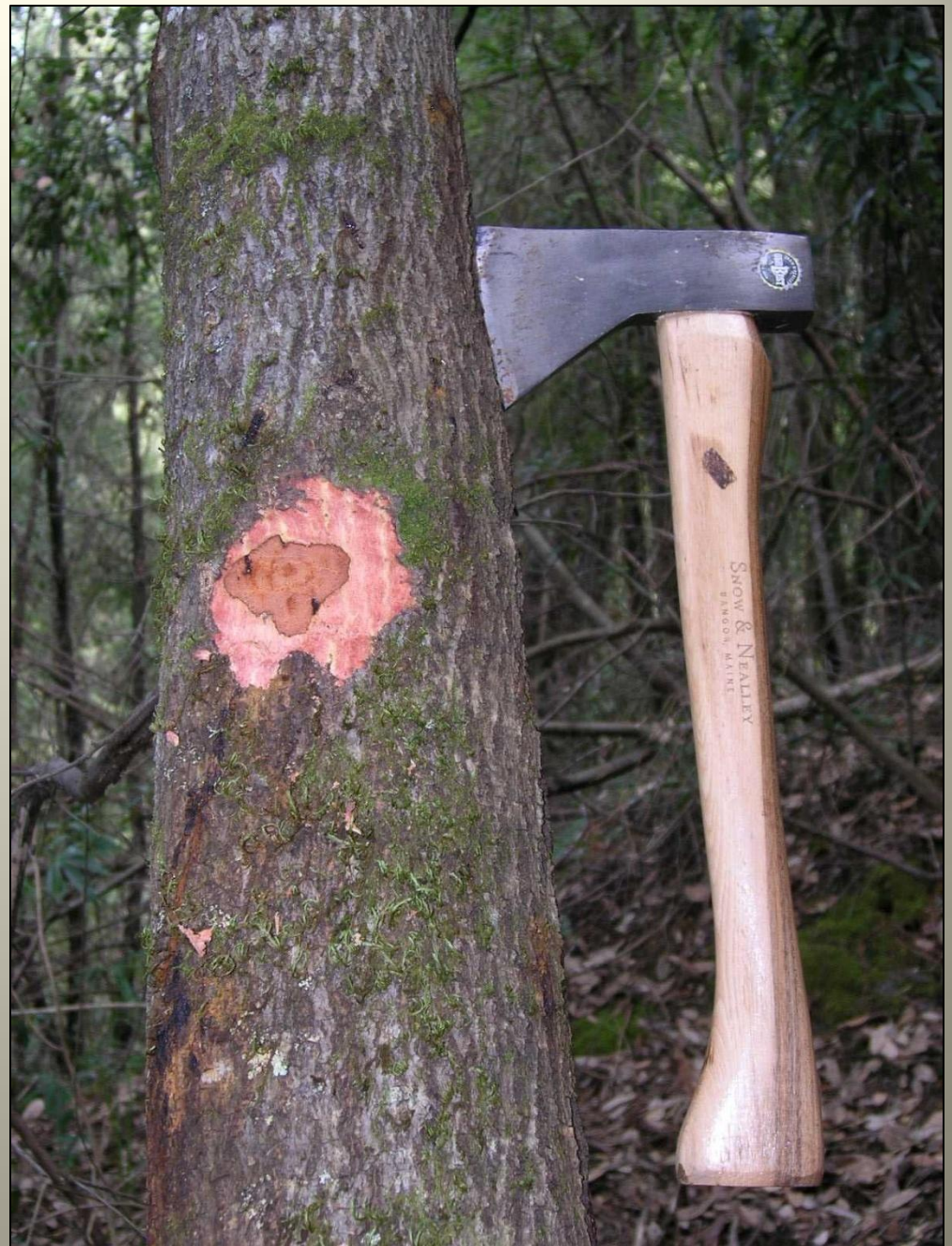
Sudden oak death canker on tanoak, N. Calif.