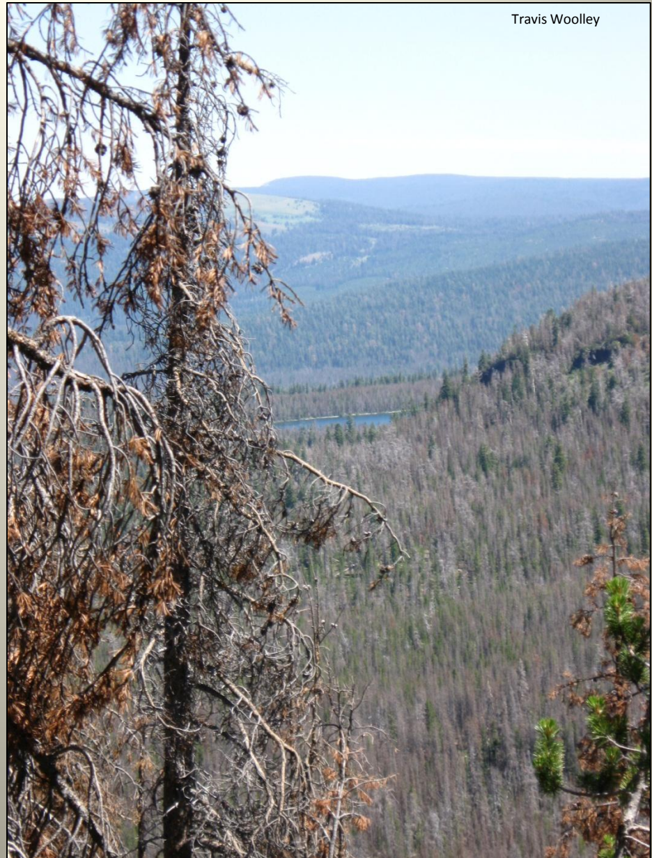
Mountain pine beetle mortality in lodgepole pine, Fremont-Winema National Forest